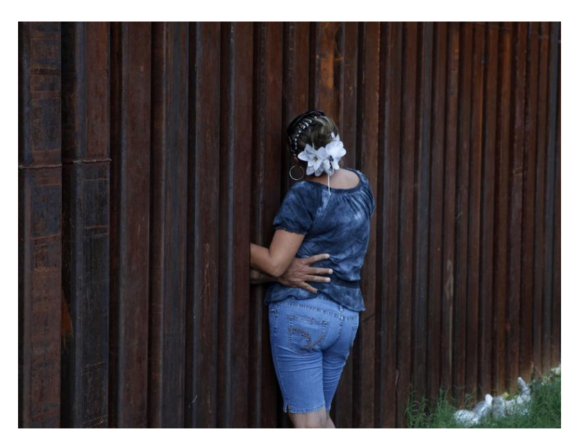
Figure 3. A woman, who declined to give her name, is hugged by her husband as they chat through the border fence separating Nogales, Arizona and Nogales, Mexico on July 28, 2010.

Even the people in this region who never cross the border are in constant contact with people from the other side. At UTEP, for example, the student body includes U.S. residents as well as hundreds of students who commute across the border to attend their classes.<sup>23</sup> Eligible Mexican students pay the