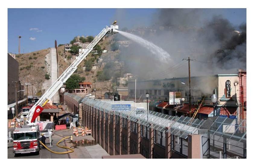
Figure 5. Firefighters in Nogales, Arizona reach over the border fence to put out a fire in Nogales, Sonora.

in inspection lanes at the five busiest points of entry on the border with Mexico.<sup>47</sup>