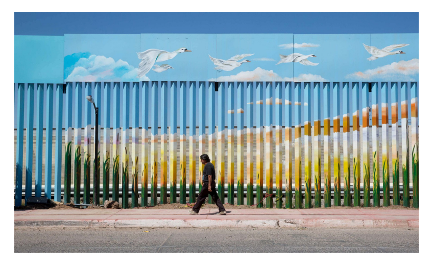
Figure 4. A man walks along the border in Agua Prieta, Mexico, separated from Douglas, Arizona by a painted fence.

Numerous cross-border institutions engage in joint environmental efforts and also cement the political and economic interdependence of the sister cities. <sup>41</sup> When a dam in Juárez threatened to burst and flood downtown El Paso, the two countries' joint International Boundary and Water Commission