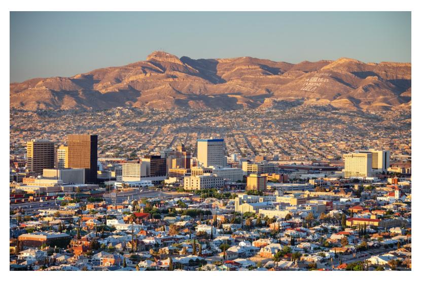
Figure 2. The rooftops of El Paso blend almost imperceptibly into those of Ciudad Juárez. Dennis Tangney, Jr., GETTY IMAGES (Oct. 9, 2013).

passengers.<sup>6</sup> They sit through the checkpoint traffic jams of spring break and Semana Santa , the Holy Week before Easter. They cross to go to the doctor's or to the shopping mall. The families living here in two countries but one community, the people drawn here by economic opportunities, tourists exploring the area's binational culture—all of them touch the border.<sup>7</sup> Understanding how the border affects people