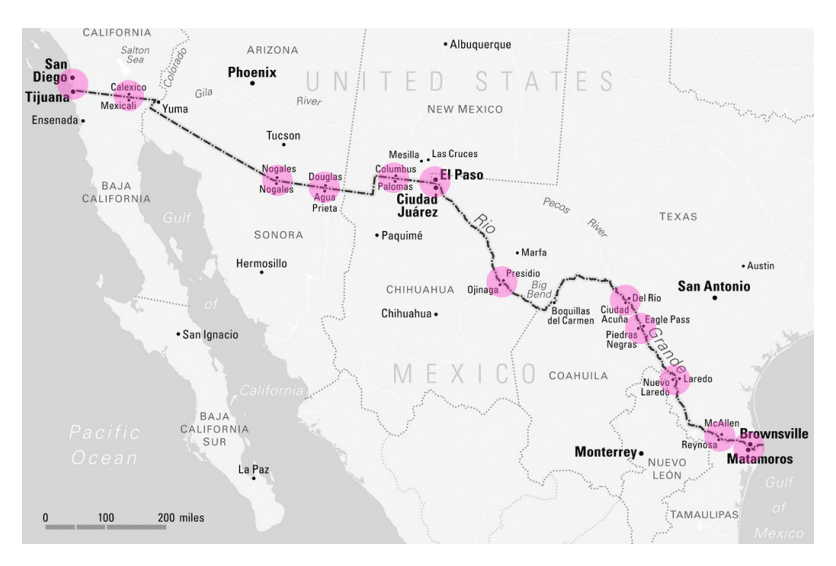
Figure 1. Cross-border communities, each comprising two twin cities, are found along the full length of the U.S.-Mexico border. MICHAEL DEAR, WHY WALLS WON'T WORK: REPAIRING THE US-MEXICO DIVIDE (2015) (map by Dreamline Cartography).