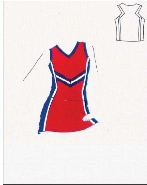
Design 0815 Registration No. VA 1-675-905