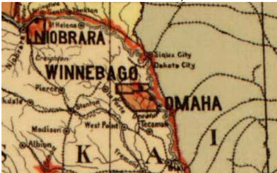
Enlarged image from 1888 Bureau of Indian Affairs Map of U.S. Indian Reservations, J.A. 1299