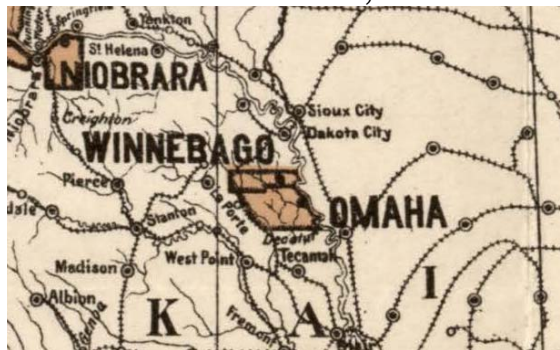
Enlarged image from 1892 Bureau of Indian Affairs Map of U.S. Indian Reservations, J.A. 1300