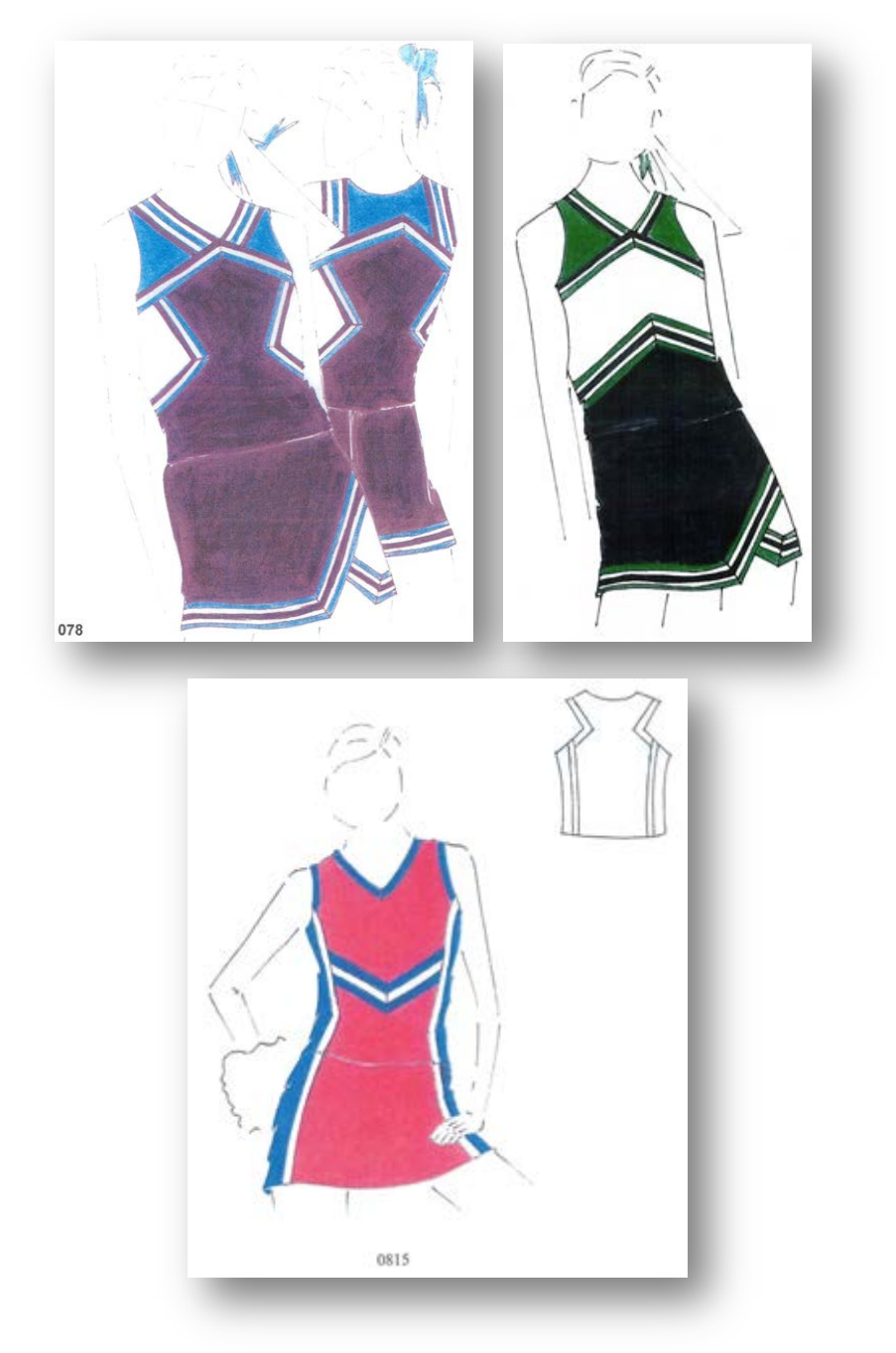
J.A. 32, 70, 81.