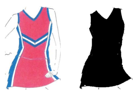
See J.A. 81 (Design 0815).

And a uniform in black, without the blocks and stripes, looks exactly like the ubiquitous little black dress: